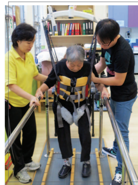
▲ 樂力長者日間訓練中心設有先進復康器材，能為有需要人士提供優質的復康服務。 Lively Elderly Day Training Centre is equipped with advanced rehabilitation equipment, which allow us to provide quality rehabilitation service to our service users.