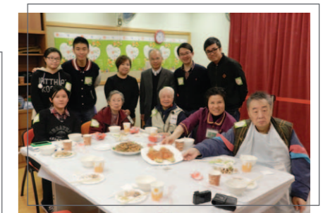
▲ 長者與年青人以美食作橋樑，開展關懷之旅。 The elders and the youth were connected by food.