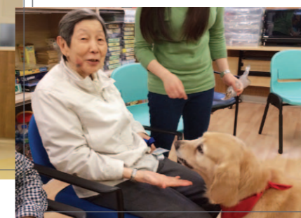
▲ 狗醫生探訪 Pet Doctor Visit