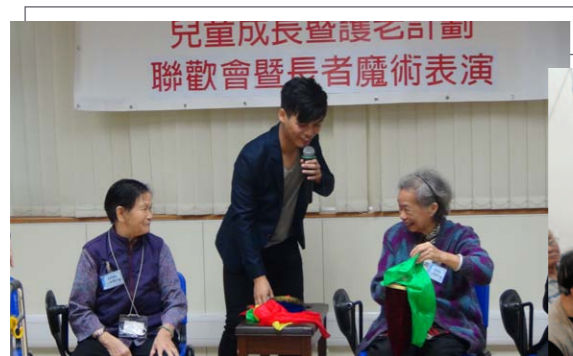
▲ 為患有認知障礙症的長者舉辦「出奇魔術團」活動。A therapeutic group, 'Wonderful Magic Team', was held for demented service users.

All 5 of our Day Care Centres for the Elderly had partnership collaboration with our Mind-Lock Memory & Cognitive Training Centre to provide different kinds of cognitive training, such as music therapy, horticulture therapy, magic training with cognitive training element and cooking class.