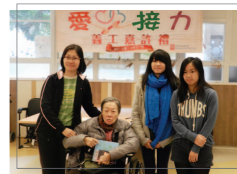
▲ 一本由青年人設計及編寫的長者人生回憶冊，成為了一個家庭生命延續的重要物。 The precious life story book, which was designed and compiled by the youth, became the important thing for life sustainability in one's family.

'Wisdom passed to future generation for sustainability; Love transfered to others for harmony'. Tsui Lam Day Care Centre for the Elderly adopted the concept of intergenerational communion and organised with the HKFYG LOHAS Youth S.P.O.T. for many intergenerational programmes, including 'Love · Relay' – production of elderly life story book, and 'Youth COOK'. Elders have rich life experience and wisdom. The youth volunteers conducted interviews, collected photos, and produced the life story books for the elders. This helped the passing of the elders' story to the next generation. While at the same time, with food as the media, the youth cooked the delicious food for the elders to make them feel gratifying. The programme also allowed the youth to have real experience in caring the elderly.