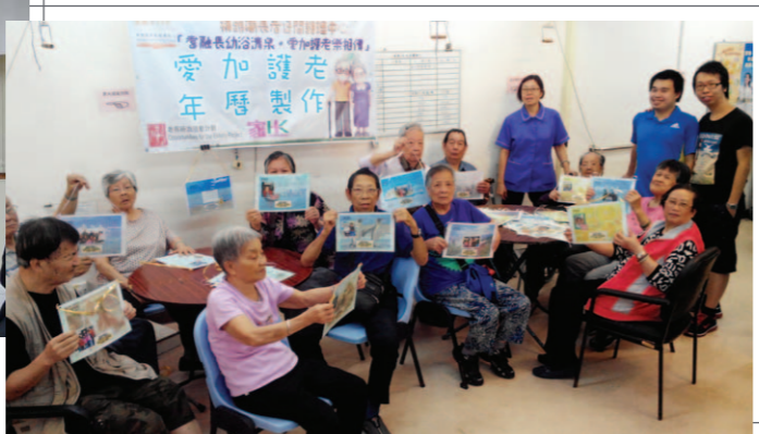
▲ 由專業導師為長者及其家人製作漂亮的年曆，令長者可以細味當年的情景，將人生美好片段好好留住，轉成回憶。Professional photographers were invited to teach elders and their families to make valuable and memorable photo calendar.