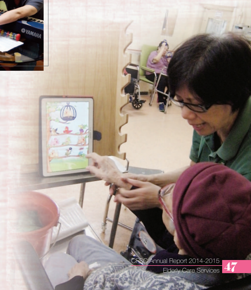
▶ 透過電子遊戲，為院友進行認知訓練。 Residents received cognitive training through playing electronic games.