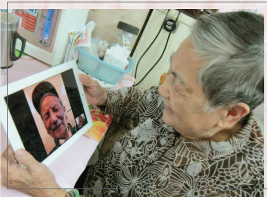
▲ 透過「FaceTime 宅急便」—心意速遞計劃，協助行動不便的長者與居住於老人院的丈夫相見。 The frail elders met with her husband who lived in elderly home via facetime.

養真苑獲得獎券基金港幣 $1,500 萬的資助，經過 15 個月施工的大型翻新工程終於在今年 2 月 14 日竣工。隨著裝修、傢具設備及設施的改善，院友享有較佳的生活環境。院舍亦將陸續添置 120 張可調式的電動護理床，以滿足日益增加的服務需要，改進後的設施有助院舍提供護理服務。