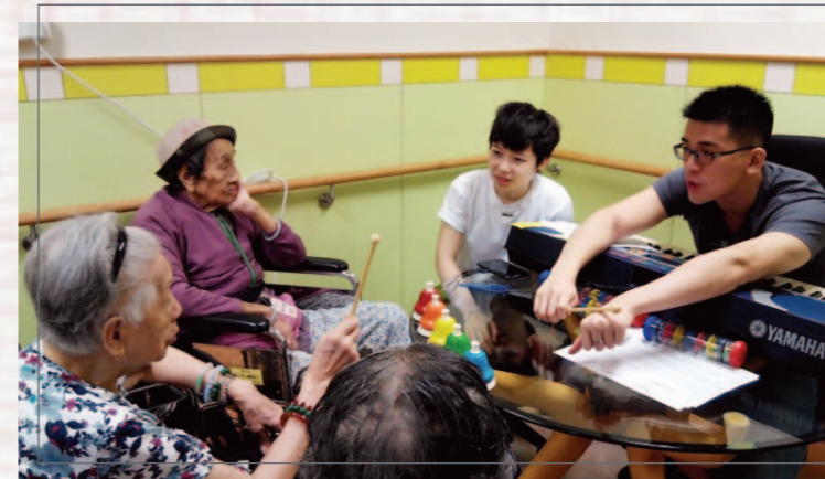
▲ 院友參與音樂治療活動。 Residents participated in music therapy programme.

On the other hand, Yang Chen House also conducted non-pharmacological therapies, such as music therapy for cognitive training, magic therapy and horticulture therapy. By using these therapeutic programmes, residents' mood and cognitive functioning were enhanced.