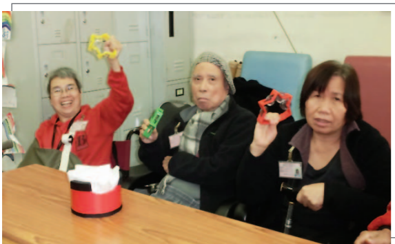
▲ 透過音樂治療師及輔助人員，讓長者參與樂器演奏及懷舊金曲欣賞，訓練長者記憶及紓緩抑鬱情緒。Music therapy was conducted by music therapist to mild cognitive impairment and depressive users.